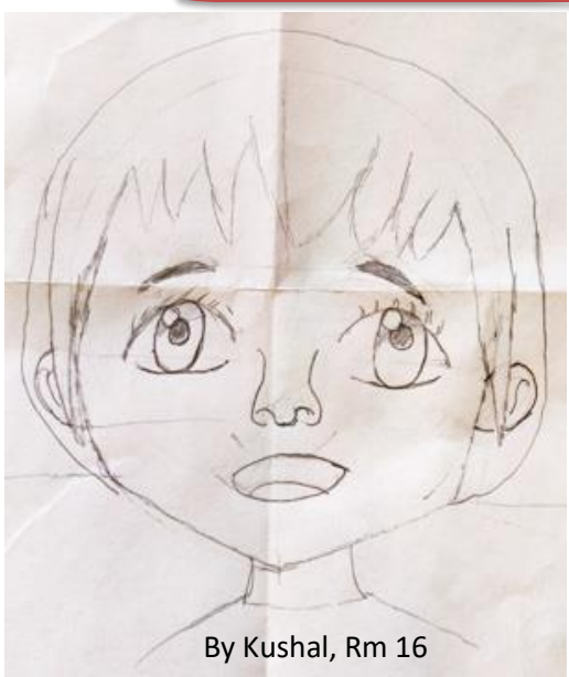
By Kushal, Rm 16