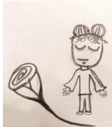
By Kalena, Rm 16